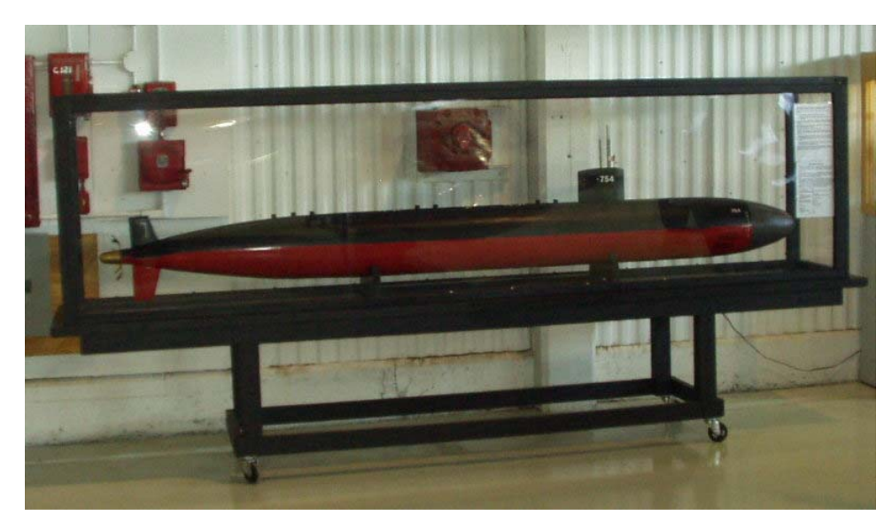
The model USS TOPEKA (SSN 754) in its new exhibit case.